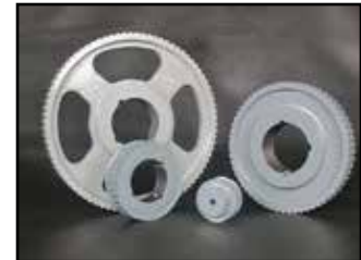
L & H Timing Pulleys