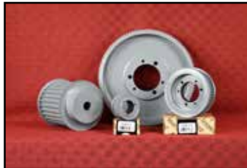
HTD Timing Pulleys